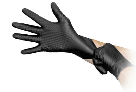
Heavy Duty Nitrile Gloves 6 mil thickness for better rip, tear, puncture and chemical resistance