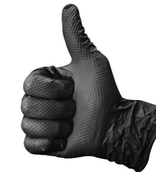
Premium Gloves Protect your hands from grease, grime, dirt, oil, fuels, nicks, scrapes and more