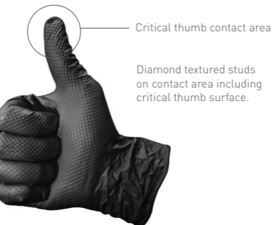
Critical thumb contact area